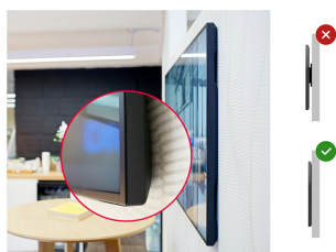
Zero-Gap Wall Mount

Designed to perform in continual, around the clock environments, the LH5070UHB can be installed and utilised in landscape and portrait orientation. The jaw dropping and best-in-class 30mm total depth (when used with the included proprietary brackets) will mean this display can be installed discreetly and elegantly in all areas.