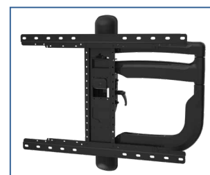
Retracts to hold display 3.0" (76mm) from the wall