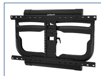
Retracts to hold display 3.0" (76mm) from the wall