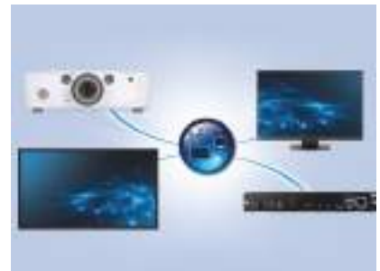
Image Control and Connectivity

An essential tool for large estates, the all-in-one NaViSet Administrator 2 software enables IT administrators to remotely manage their network of Sharp/NEC display and projector devices and Windows PCs. In multi-device environments, this system simplifies the handling and control of devices helping to keep maintenance costs low, minimise downtime and ensure the efficient use of resources.