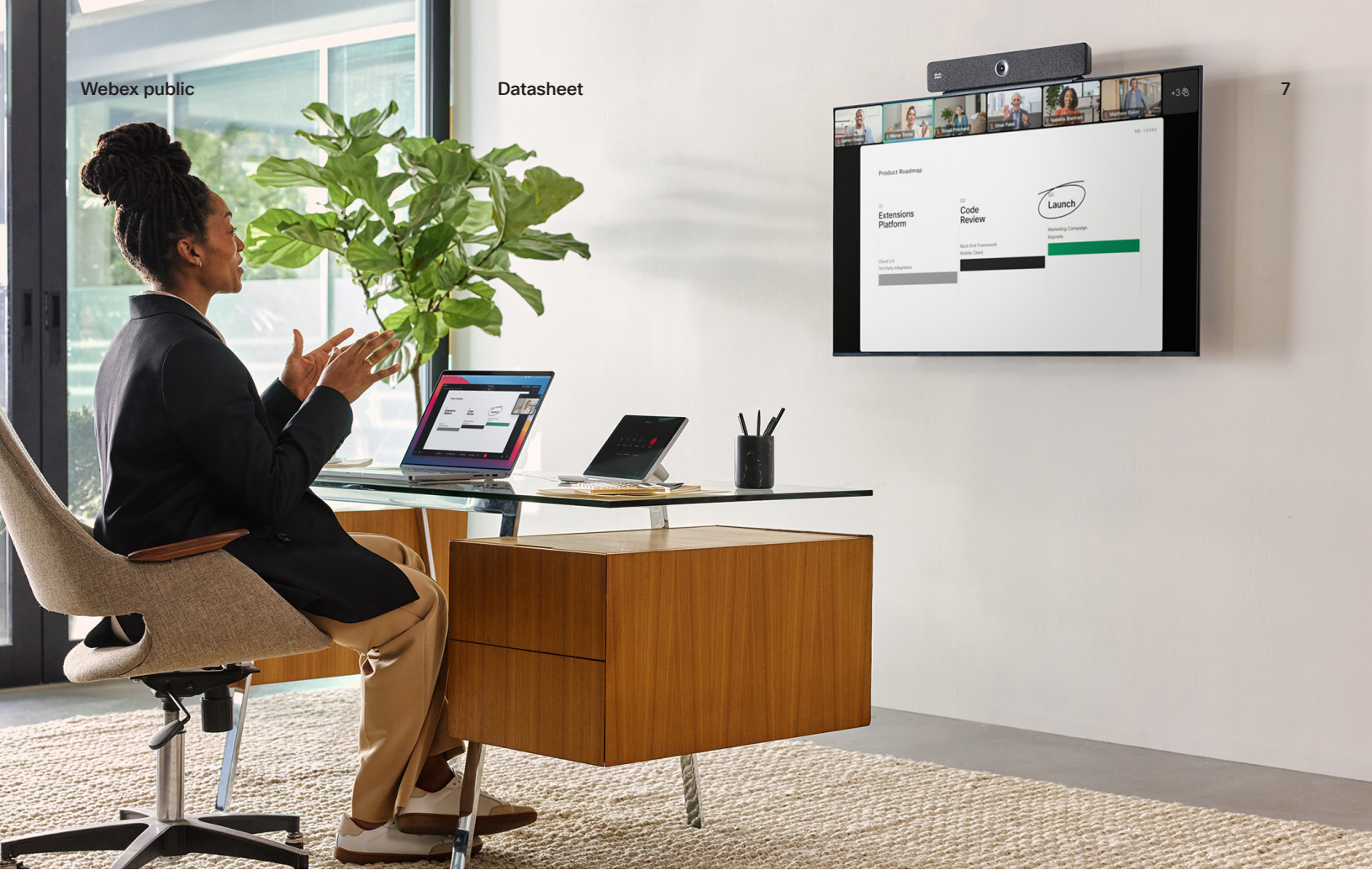
Figure 4. Cisco Room Bar used for video conferencing and wireless content sharing in a dedicated office